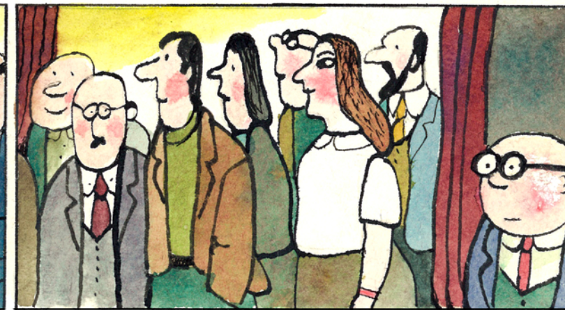
6. As it turned out, it was rather easy to identify who it was. It became obvious when the audience started to walk out of the theater.

Answer: Inspector Pike noticed that the hand that he sighted in the cloakroom, wore a red wristband. It was the same wristband that was on one of the visitors who was leaving the theater.