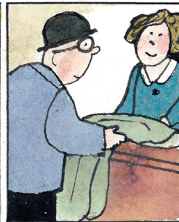
2. While I was checking my coat in, I had witnessed a peculiar incident.