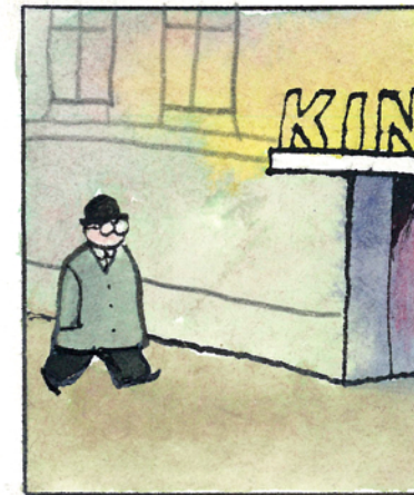
1. I went to movies to see the latest Czech picture.