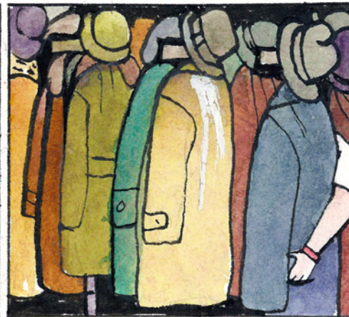
3. Among the coats I sighted a groping hand that was searching in the pockets of the coats. It was obvious ...