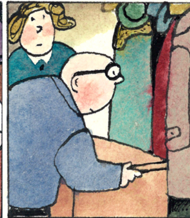
4. ... a thief was hiding among the coats, however, before I was able to get there ...